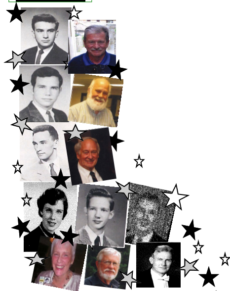
Hall Of Excellence 2013

1 Mt. Hope Blvd. Hastings-on-Hudson, NY 10706